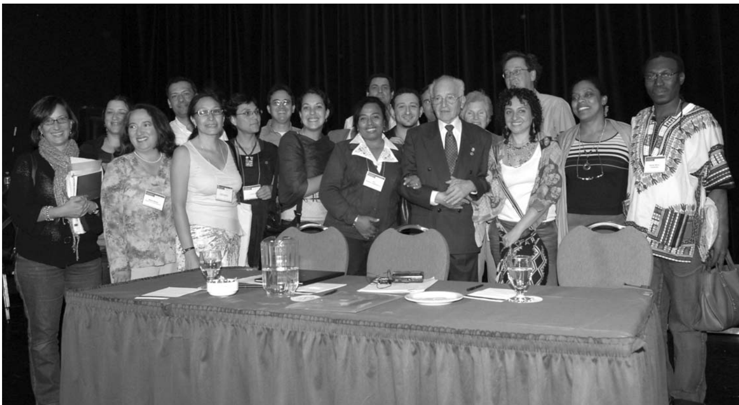
Orlando Fals Borda, LASA/Oxfam America Martin Diskin Lecturer, and group of Colombian participants