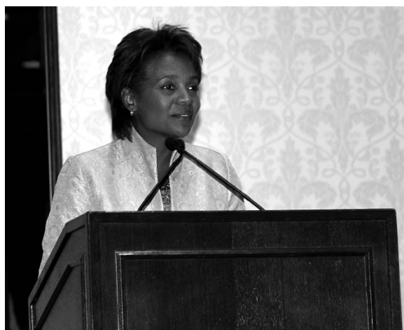
Her Excellency The Right Honourable Michaëlle Jean, C.C., C.C.M., C.O.M., C.D., Governor General of Canada