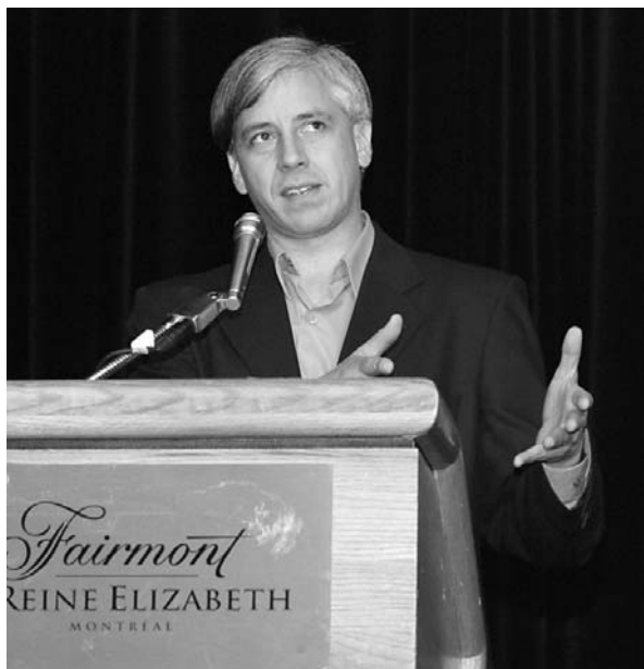
Álvaro García Linera, Vice President of Bolivia