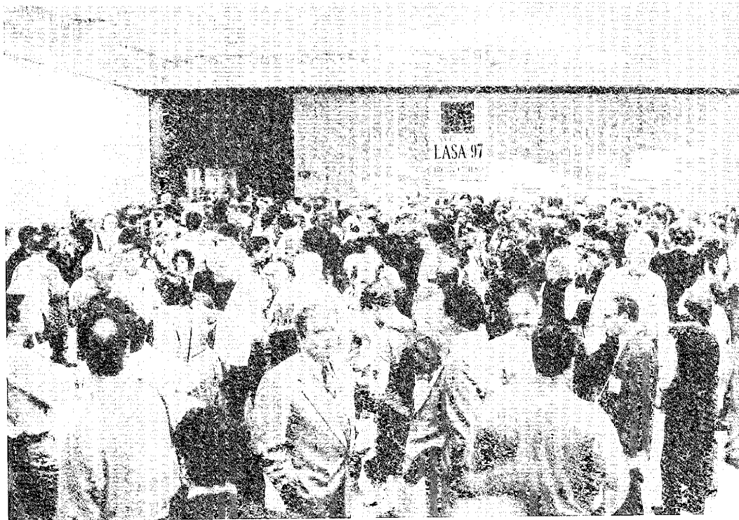
Capacity crowd at the Wednesday Welcoming Reception.