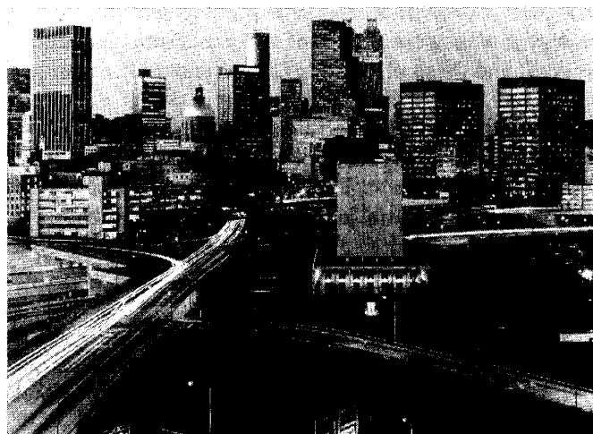
Midtown skyline. Included in the ever-expanding Midtown skyline are the One Atlantic Center (formerly the IBM Tower), Promenade, 1100 Peachtree, Campanile, Sheraton Colony Square Hotel and Mayfair Apartments buildings.

For entertainment try the unique Center for Puppetry Arts whose workshops and performances are geared for adults as much as for children.