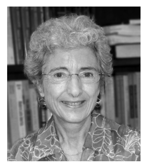
Essentially, the Association is what committed members make of it. And they have made it strong through their dedicated service.

This Congress signaled the end of my year-long presidency. It was an honor and a pleasure to serve in this capacity. LASA is a strong organization with lots of dedicated members who serve in many roles, from track chairs to Section chairs and members of award and other committees.