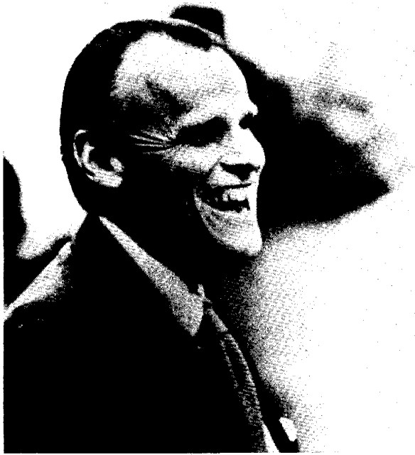
George Alexander Kubler Recipient of Silvert Award for 1992

George Alexander Kubler, Sterling Professor Emeritus of History of Art and Senior Research Scholar of History of Art, Yale University, is the 1992 recipient of the LASA Kalman Silvert Award.