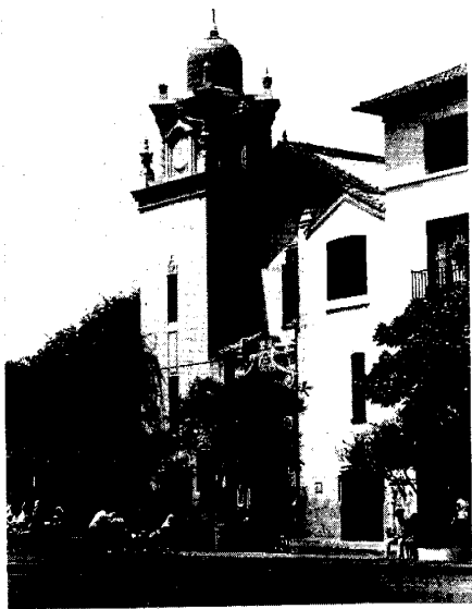
La Plazita, downtown, a gathering point of the Latin community. Olvera Street leads off from this plaza

Olvera Street and La Plazita. While the trinket and clothing booths as well as the restaurants and live music provide Olvera Street with the substance of a tourist spot, it is also home to the Mexican Consul in Los Angeles, Our Lady Queen of Angels church, and a gathering point for Latin families and couples, particularly on weekends. Located downtown, on Alameda across from Union Station, Los Angeles' train central. The area also is bordered by Los Angeles, Main and Macy Streets.