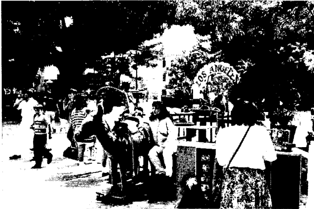
Photo booth at Olvera Street

Griffith Park Observatory and Planetarium has the largest public telescope in California and a projected star program on the 75-foot domed planetarium. Laser light and music shows are given nightly (except Mondays), with recent presentations featuring music from Rush, U-2, Pink Floyd and Star Trek . 2800 E. Observatory Rd. (on the south side of Griffith Park, between Vermont Ave. and Western Ave. entrances). Telephone: (213) 664-1191. Laserium, telephone: (818) 997-3624.