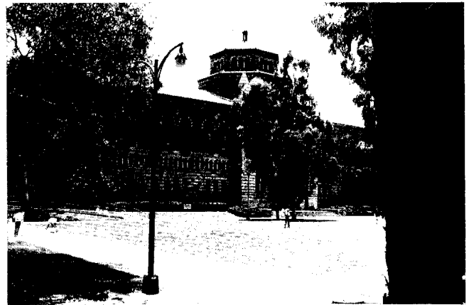
Union Station downtown, main train depot and starting point of the new Los Angeles subway "Metrorail" scheduled to open March, 1993

increasing economic polarization of U.S. society in general. We are confident that several sessions in LASA's XVII International Congress will address themselves to these kinds of problems.