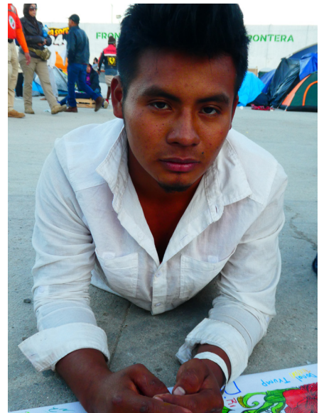
Young Guatemalan caravan participant helping to create a mural.