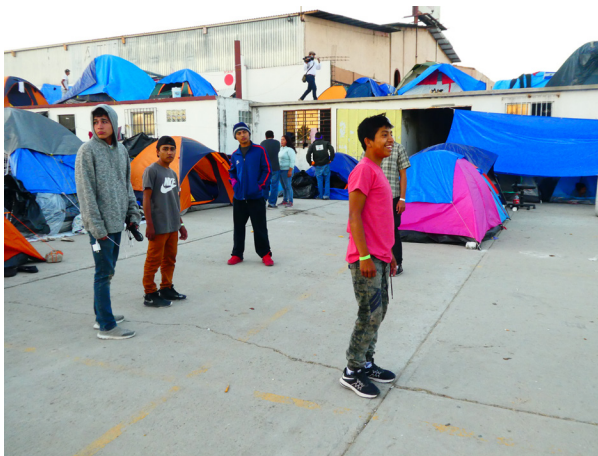
Impromptu soccer game inside the shelter.