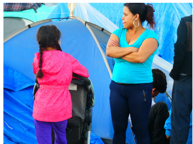
Mother and daughter outside their tent watching a nearby soccer game.