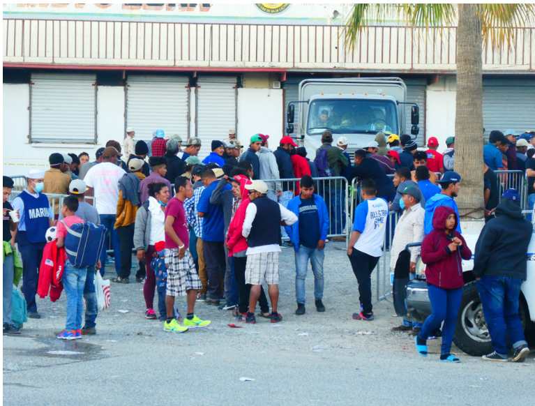
Caravan members line up for afternoon lunch outside of El Barrital shelter in Tijuana, Mexico.

As we finish this issue of the LASA Forum, El Barrital is also slated to close down soon. As of January 15, 2019, about 700 people remained in the shelter,