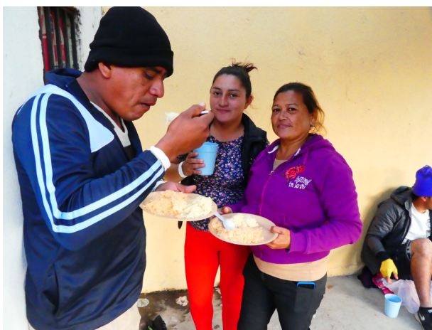
Honduran family eating lunch together inside the shelter.

Meals were being served to people on paper plates. The plates had rice and noodles on them; some people had soup. I chatted with a Honduran family consisting of two sisters and their children sitting on stumps and low rocks just outside the entrance of the shelter. They told me that conditions have improved for them since leaving the other shelter and they were happy to be dry and fed. They had put their names on a list to be called to the San Ysidro port of entry to receive a credible fear interview with an asylum officer in the hopes of being let into the US. They hinted at neighborhood violence, sexual violence, and very difficult conditions behind their decision to flee and bring their small children in the caravan.